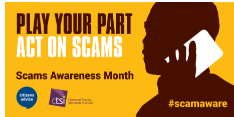
Scams: Is anyone YOU know vulnerable?

Debt Our 5-Step process can help. Try it.